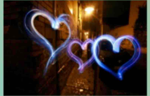
Eric Staller - Light Trails

In this project you will learn about the creative potential of varying the control of the shutter speed, or exposure, of your camera. Values are recorded in seconds or in fractions (eg, 1/200th) The techniques such as blurring, freezing and panning using very fast or slow shutter speeds, and repeated/overlaid images, to capture and suggest motion have been used as creative techniques for many years, from the earliest experiments by Eadward Muybridge, via the Futurists, to Youtubers the Slo-Mo guys and Light Trails / Painting with Light photography.