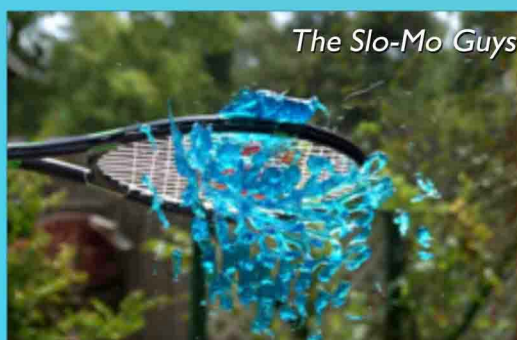
The Slo-Mo Guys

You should also ensure that your technical knowledge includes noting accurate records of the shutter speeds used, and how varying the exposure affects the light levels.